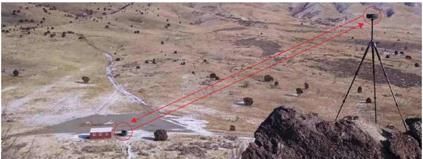
RADIO RECONNAISSANCE TECHNOLOGIES

ThiEF, from Radio Reconnaissance Technologies, is a miniature, man-portable, fully integrated signal intercept and directional line of a bearing system designed to prosecute VHF and UHF analog, single-channel, push-to-talk radio transmitters. The system utilizes proven direction-finding techniques incorporated into modern technology to reduce size, weight, and power while increasing performance parameters.