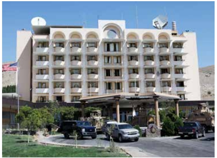
U.S. ARMY SPC. RYAN GREEN

Personal security detail (PSD) training includes all aspects of providing close protection in high threat environments. Instructors relate formal training with operational experiences that prepare the PSD team member for success in the most severe situations.